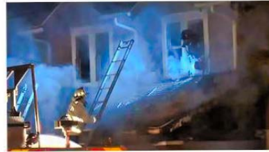
A deadly house fire killed five children late Sunday night in Youngstown, Ohio.