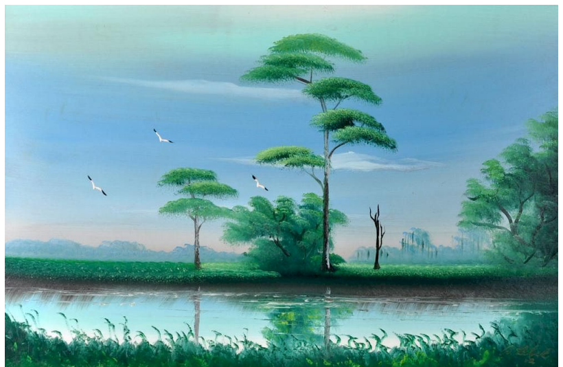
Welcome Snowbirds: Florida Highwaymen Painting Image Courtesy, Al Black